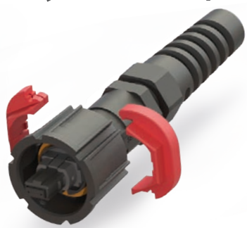
Retro Fit Safe Lock Add Safe Lock ring as needed in field