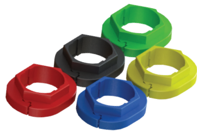
Multiple colors for Identification