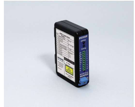
U.S. Patent 7,196,320 Inherently Safe Optical Radiation For EPL Mb/Gb/Gc/Db/Dc

The controller keeps track of position and also calculates the RPM and speed of the connected encoder. Both position and speed can be read via RS485 Modbus RTU serial interface, USB, SSI or analog output. The analog output can be configured for either \pm 10V or 4-20mA output.