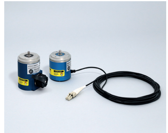
U.S. Patent 7,196,320 Inherently Safe, Simple Mechanical Device EPL Mb/Gb/Gc/Db/Dc

The remote MR340 Controller Module transmits and converts optical signals to/from the Sensor. The Controller's multiple built-in interfaces insure compatibility with industry standard motor drives, PLCs, quadrature counters, and motion control systems.